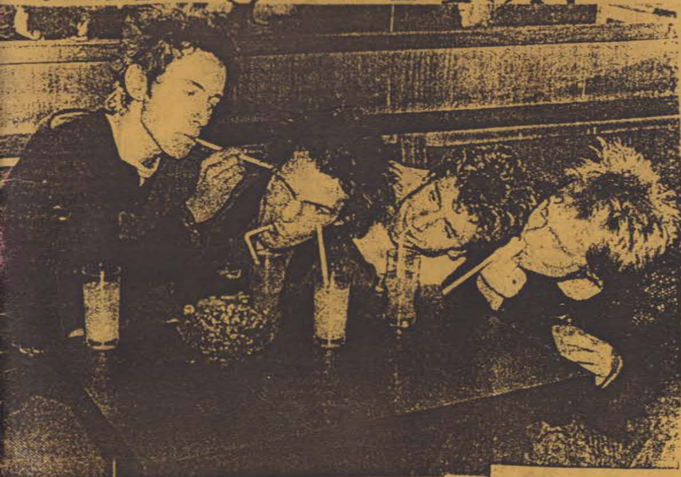
Sex Pistols in 1977, from left: Johnny Rotten, Sid Vicious, Steve Jones and Paul Cook.